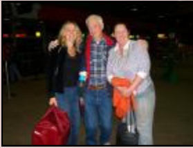
Leaving for Timor