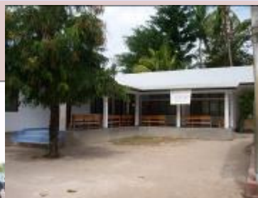
The local hospital. Doctors available 9am-12pm each weekday

The people of Atauro Island are already undertaking community projects like, the Craft Group, the Pescatori school, jewellery making and the restaurant all run by co-ops where the funds go back to the community.