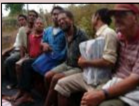
Riding in the open air taxi!