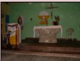
Altar at Macadade