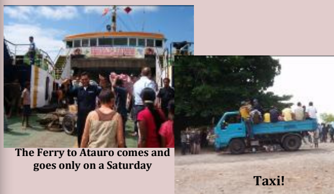
The Ferry to Atauro comes and goes only on a Saturday