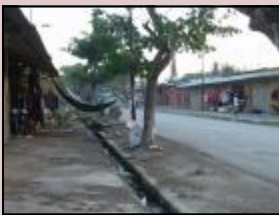
Streets of Dili