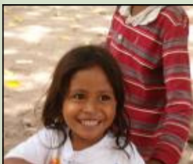
They have very little and yet look at the smile—Atauro Island

Meets—3rd Tuesday of each month in the Parish Centre